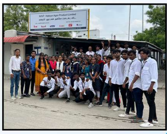
Industrial visit to Hatsun Agro Product Ltd., Kanchipuram Organised by BBA Department on 18th May 2022 for III BBA students.